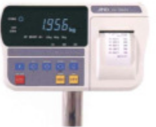
Printer (only for VFD Type-Option HV/W-06-G) Dot Impact Printer Print out your data for safe keeping.