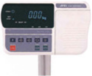
Portable Battery Operation VFD 0.8"(20mm) Operate in areas with low or no power.