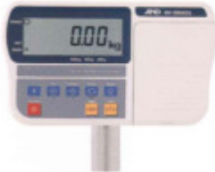
Large and Clear Display Digit height : LCD 1"(25mm)