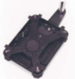
Water and Dust Resistant Protection for Load Cell Sensor The Gore-tex® membrane wicks moisture away and keeps it away.

Gore-Tex® is a registered trademark of W. L. Gore & Associates.