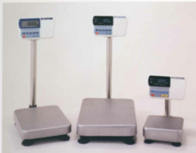
▲ Popular Standard Medium Type